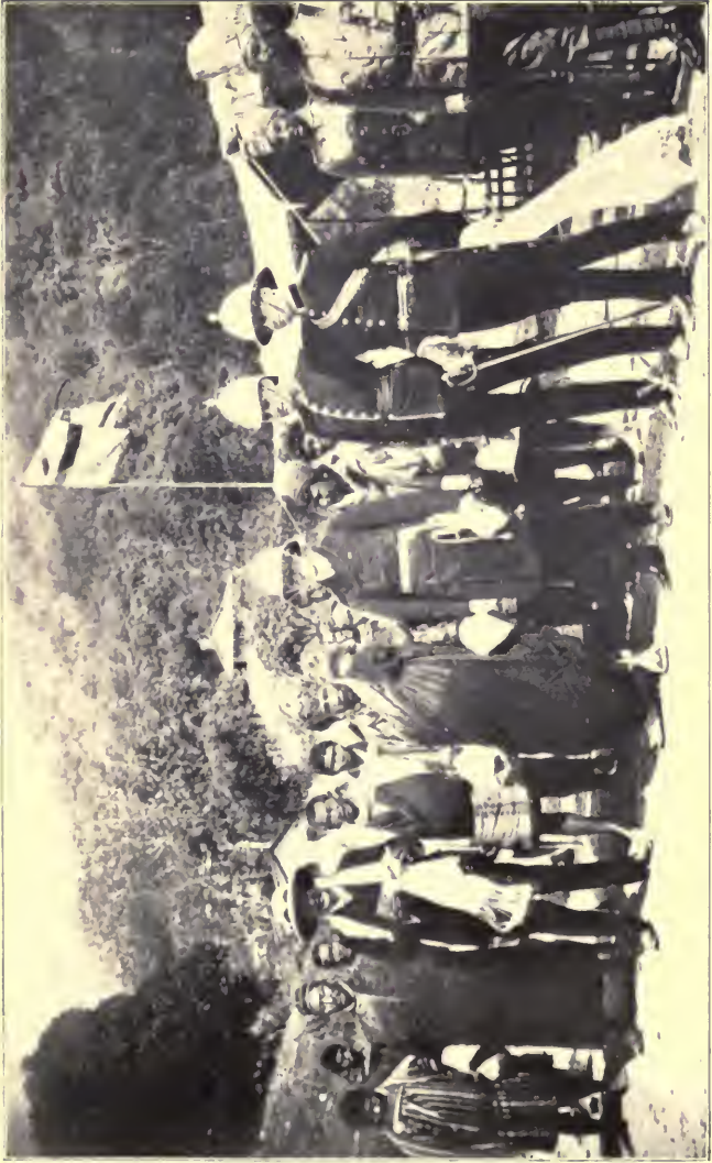
THE DURBAR IN BUNA.